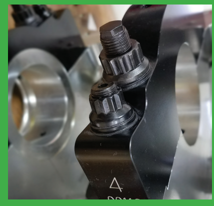
7075 aluminum main caps with 9/16" center studs and ½" splayed outer studs.