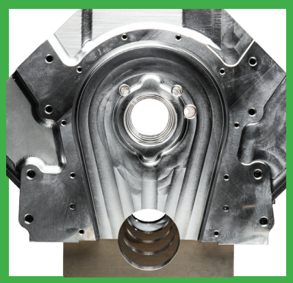
Raised cam 55 mm babbitt to 60 mm roller cam tunnel.